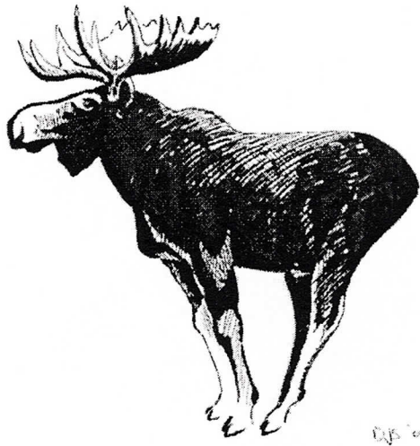
Fig. 1. Bull moose displaying horseshoe posture. Note the forward pointing, uplifted head, position of the back hooves in relation to the front hooves and the closeness of the back legs compared to the wider stance of the front legs. From the side, the front and back legs and the abdomen resemble a triangle.

Maine. While watching a bull moose early one morning at a mineral lick, the bull became rather agitated as the sound of traffic increased on the highway about 150 m away. When a large truck went by, the bull ran for a few steps, suddenly stopped, assumed the horseshoe posture and urinated profusely on his hocks. His level of agitation remained and about 2 minutes after assuming the posture the first time, he repeated the behaviour again, with some urination on the tarsal gland, before running off into the adjacent bush. The behaviour was again recorded with a video camera.